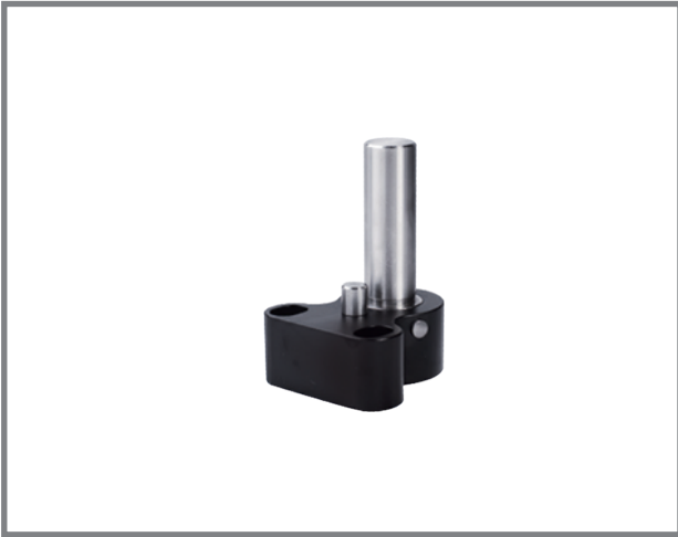
Tonometer Adaptor (R type) (For R type applanation tonometer)

(Available for S350/S350S/S350C/ S360/S360S/S390H/S390L)